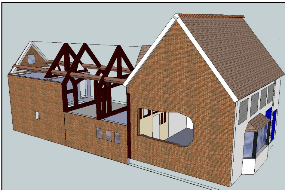
Viewed from the SW side

The full frame is thought to be the back frame of a 15 th century house where the hall now stands. The next frame to it is thought to be the front external frame of a second 'utility' house of similar age built behind.